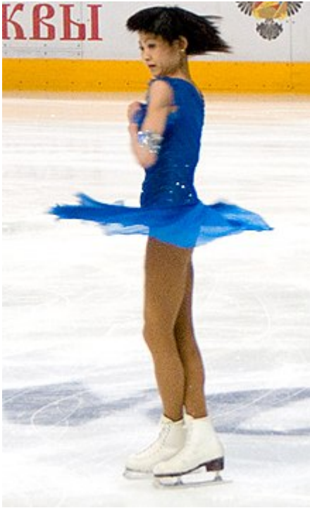
A figure skater in a spin uses conservation of angular momentum – decreasing her moment of inertia by drawing in her arms and legs increases her rotational speed.

How do we accomplish an exponential rise of potential energy without violating the conservation of angular momentum ? By separating the mass m of the moment of inertia from its radius (squared) r^2 , we dematerialize the moment of inertia into its electrical equivalencies of: inductance H representing mass m , and capacitance F equaling radius (squared) r^2 . But we may only accomplish this whenever current becomes inverted relative to voltage. And this dematerialization occurs due to a translation from real numbers dominating the scene into complex numbers taking over with emphasis on its imaginary coefficient \sqrt{-1} dominating the complex