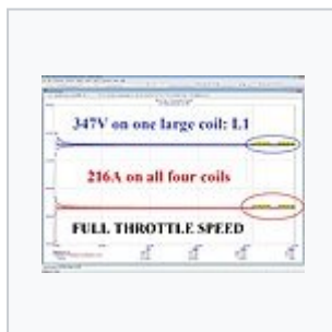
AC Motor Inversion, v2 - tracings.jpg