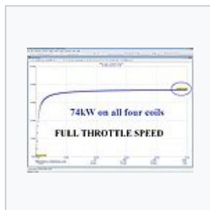
AC Motor Inversion, v2 - wattage tracing.jpg