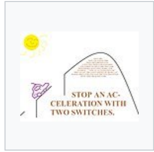
Cutting OFF Acceleration with Two Switches.jpg