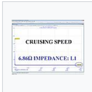
Inverted, Shorted Motor of High Frequency, v6 - impedance tracing for cruising speed.jpg