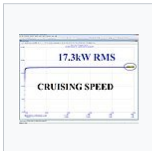
Inverted, Shorted Motor