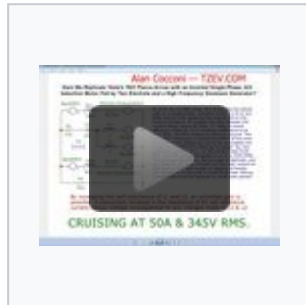
Inverted, Shorted Motor of High Frequency, pt2.ogv