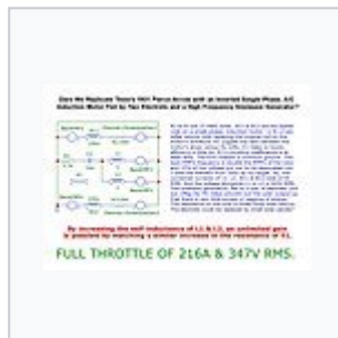
AC Motor Inversion, v2 - schematic.jpg 1,438 × 1,000; 497 KB