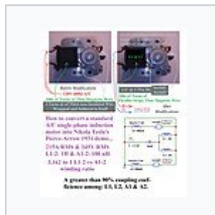
AC Motor Inversion, v2 - motor hints.jpg 3,304 × 3,832; 1.68 MB