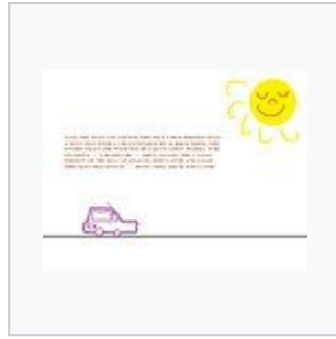
Cruising along on Level Ground at a Constant Speed.jpg