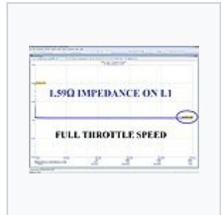
Inverted, Shorted Motor of High Frequency, v2 - impedance tracing for full throttle speed.jpg