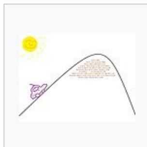
Accelerating Up a Hill or into Traffic on the