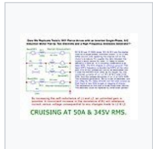
Inverted, Shorted Motor of High Frequency, v6 - schematic for cruising speed.jpg