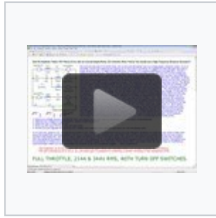
Ammann Bros. Mystery Solved !.ogg