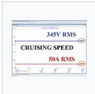
Inverted, Shorted Motor of High Frequency, v6 - amp & volt tracings for cruising speed.jpg