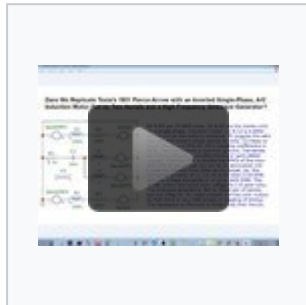
Inverted, Shorted Motor of High Frequency, pt1.ogv